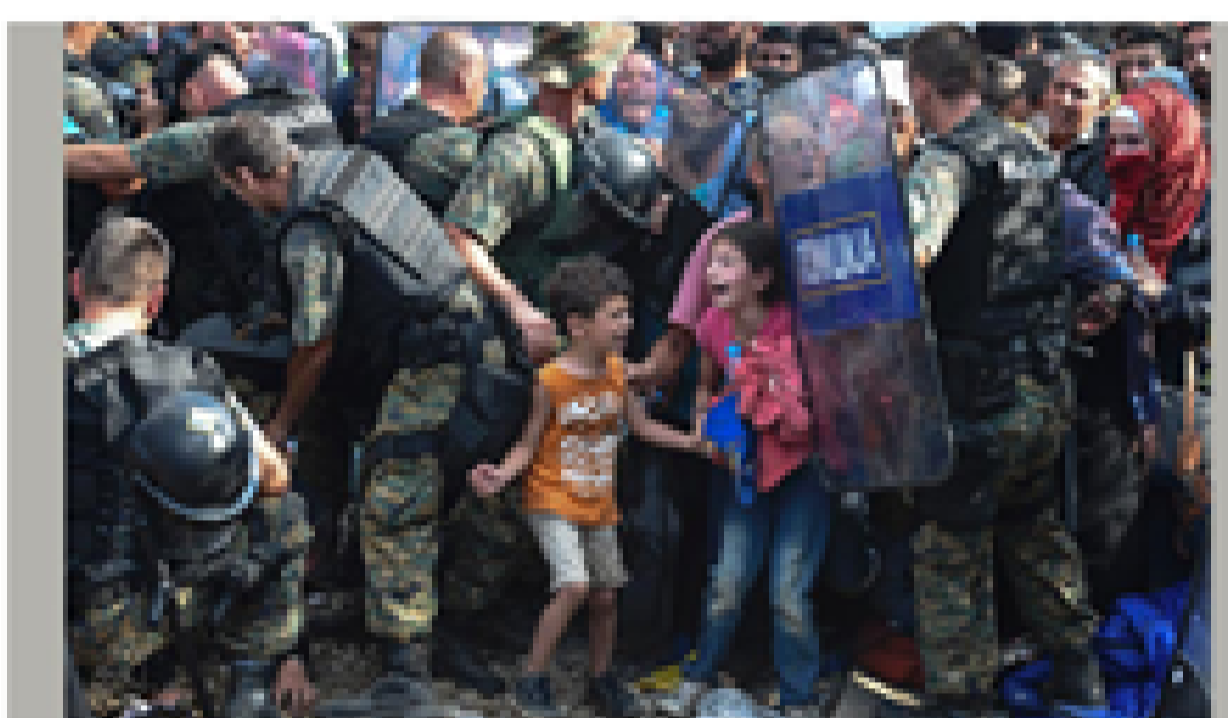
Refugee Kids at the Greek-Macedonian Border